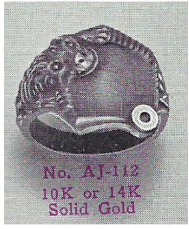
Men's rings Japanese signet tokens -Keen's Diamond Merchants 1928. Other animals and mythical creatures were also options, and the round opening at the bottom right is for a diamond!

Monkeys, turtles, elephants, camels, and snakes make appearances in many era jewelry catalogs. Even mythical creatures such as dragons and chimeras could be found.