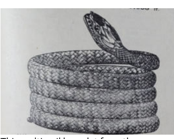
This multi-coil bracelet from the Tribuaudeau Factory catalog, 1929 could be purchased with 2 or 4 coils, and with or without gemstone eyes.