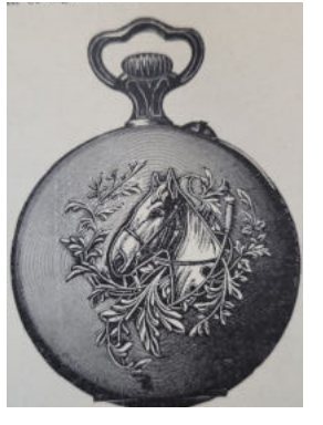
Tribuaudeau Factory catalog, 1929 —Pocket watch with horse design.