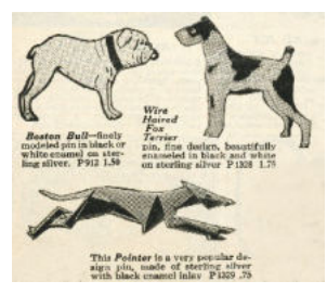
Daniel Low 1930 - dog pins