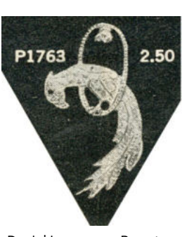
Daniel Low 1930—Parrot on perch.