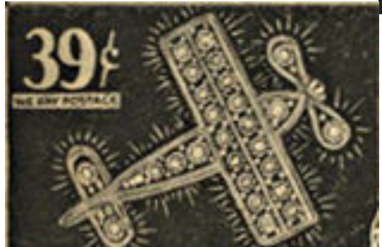
1930 Bellas Hess— Airplane pin

Airplanes were a novelty in real life so of course they captivated ladies as jewelry.