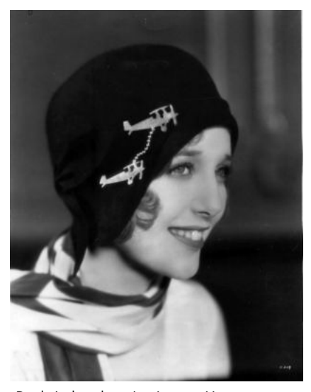
Dual airplane hat pin—Loretta Young 1929

Airplanes were a novelty in real life so of course they captivated ladies as jewelry.