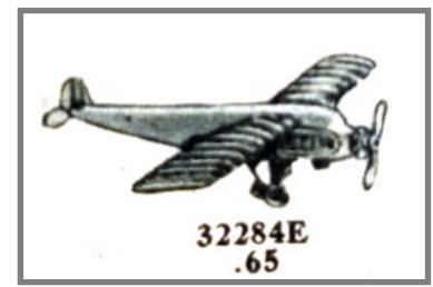
1930 Jason Weiler-Baird North Co — "Aeroplane" in sterling silver