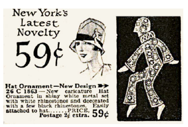
1928 Bellas Hess jester or clown hat pin

Just to be clear, it seems that these whimsical pieces were likely not found in large numbers. However enough of them can be found to document that people in the Model A era still had a sense of fun. The above examples include costume jewelry and fine jewelry with diamonds, gemstones and platinum and other precious metals. So, no matter what your budget and style, don't be afraid to shakeup your jewelry box and add a playful touch to your era fashion!