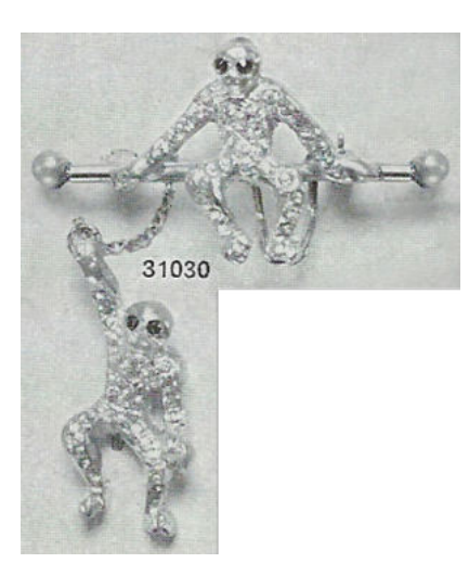
Chas. L. Trout Co 1931—Monkey dangle .brooch. Simulated Ruby eyes.