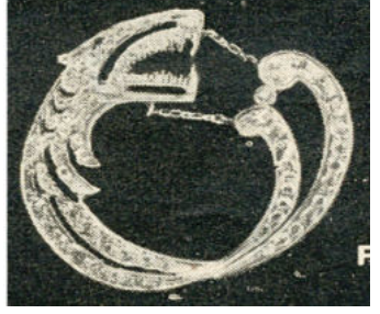
Daniel Low 1930—Dragon pin