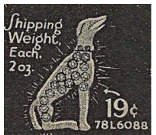
Montgomery Ward Fall and Winter 1928-29 - dog novelty pin