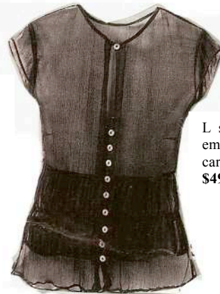
L sheer embellished cardigan $49.