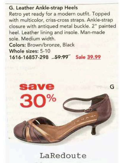
G. Leather Ankle-strap Heels

Available in Black, Navy, Brown, Burgundy, and Gold 29.99 Tori