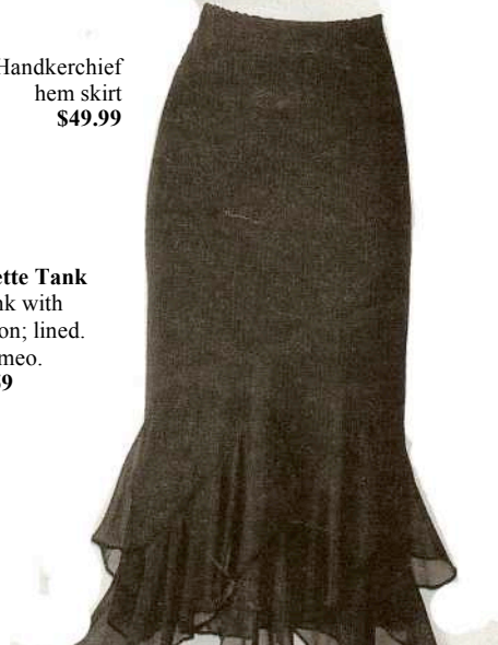
H Handkerchief hem skirt $49.99