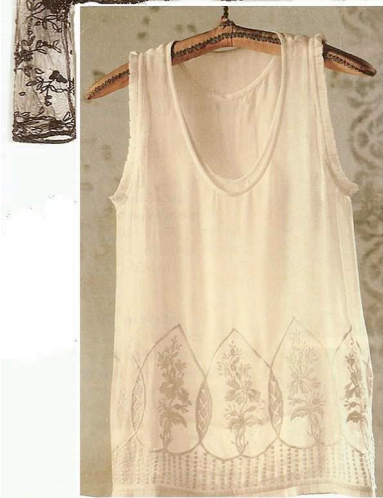
F Embroidered Georgette Tank Silky-sheer georgette tank with ornate embroidery. Rayon; lined. Dry clean. Imported. Cameo. DH13174 Sizes 2-18 $59