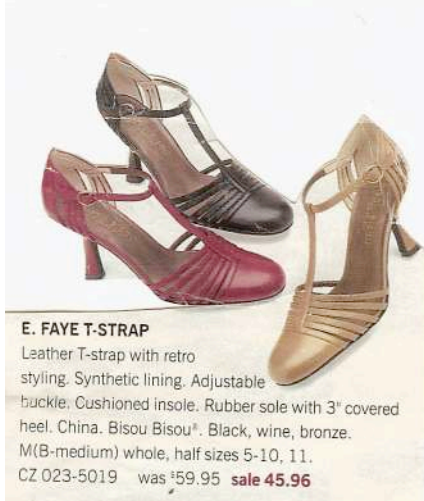
E. FAYE T-STRAP

Leather T-strap with retro styling. Synthetic lining. Adjustable buckle. Cushioned insole. Rubber sole with 3" covered heel. China. Bisou Bisou®. Black, wine, bronze. M(B-medium) whole, half sizes 5-10, 11. CZ 023-5019 was $59.95 sale 45.96